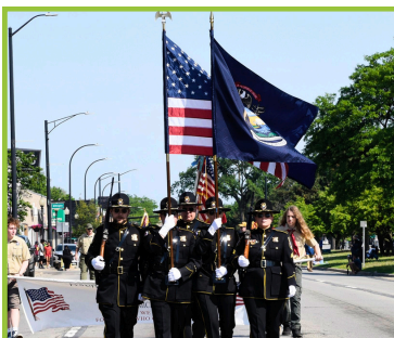
9 Memorial Day Parade

All events are subject to alteration or cancellation. Visit ferndalemi.gov/calendar for a calendar of events.