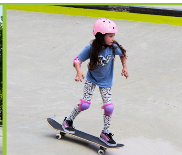
Geary Park Skate Jam