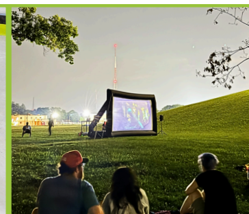
Movie on the Hill