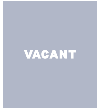
Vacant Position (to be appointed by Ferndale City Council in May 2026)