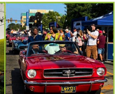
Woodward Dream Cruise